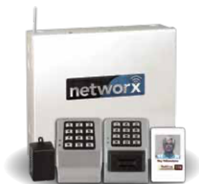
NET-DKPAK & NET-PDKPAK

Trilogy Networkx Wireless Keypads and NetPanel combine to provide the ideal wireless keypad solution for use with mag locks, strikes and electrified exit devices in a smart access system with advanced features & functions, like automatic schedules, event logs and support for 2000 doors and 5000 existing Prox. ID Cards/Badges. The Networkx Panel communicates via a Networkx Gateway networked to any Windows-based PC. Networkx keypads seamlessly share one common database hosted on free Alarm Lock free software (along with Networkx locks and standalone Trilogys too.). This cost effective system is very scalable, and up to 63 NetPanels,