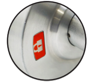
Red (IN USE) and Green (VACANT) Indicator

For other lever designs, replace GN , with design name. Example: INDCGN-20 U26D in "AUG" is IND-AUG-20 US26D