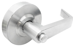
Inside Push Button

BHMA TM CERTIFIED Be Safe. Be Secure. Look for the Mark.