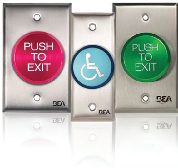
SHOWN ABOVE: SINGLE STYLE WITH RED AND GREEN 2 INCH BUTTON JAMB STYLE WITH BLUE 1 5/8 INCH BUTTON